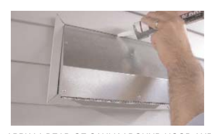
APPLY A BEAD OF CAULK AROUND HOOD AND SIDING. INSERT SCREEN IN HOOD.